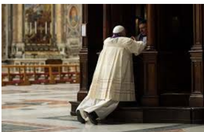
12. Ask for mercy ...