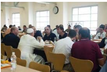
15. Break bread with people ...