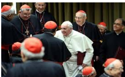
14. Conversation is the key ...