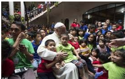
11. Love the kids ...