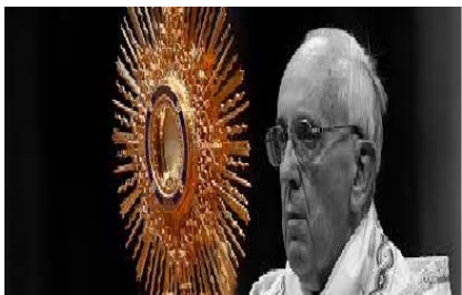
13. See, encounter Jesus ...