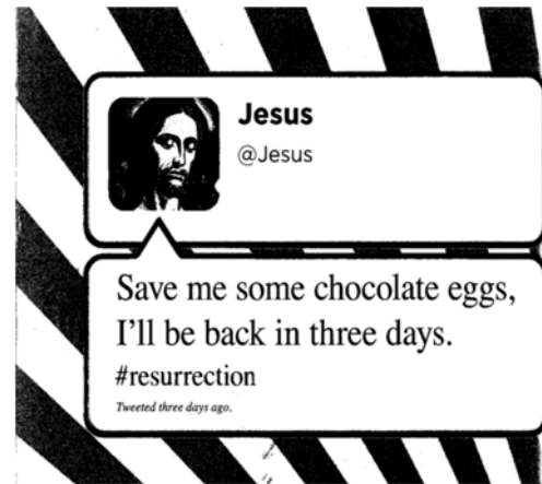
MOTHER GOOSE & GRIMM By Mike Peters