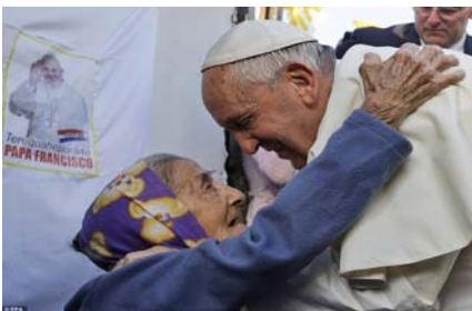
4. Look into people's eyes