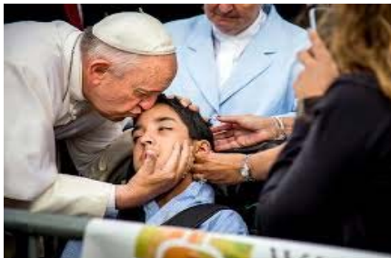
2. Pray with and bless people