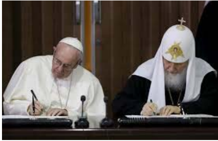
1. Build bridges