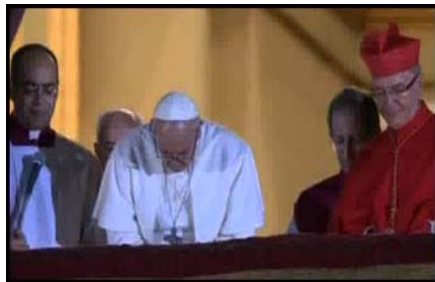
3. Ask people to pray for you