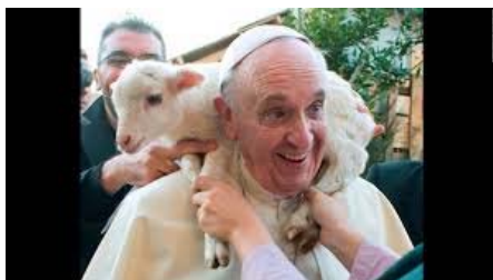
10. Go out of your way