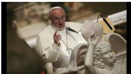
9. Preach with conviction