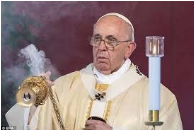
7. Encourage reverent liturgy