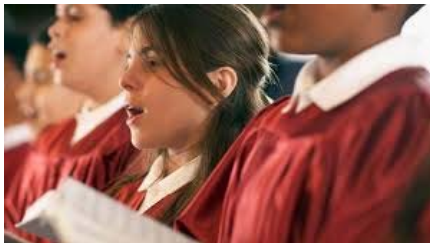
8. Insist on good music