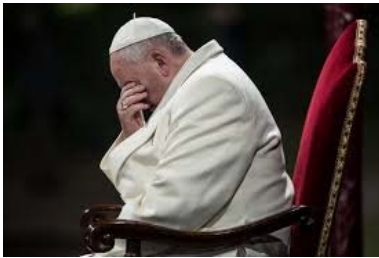
6. Be faithful 'til it hurts